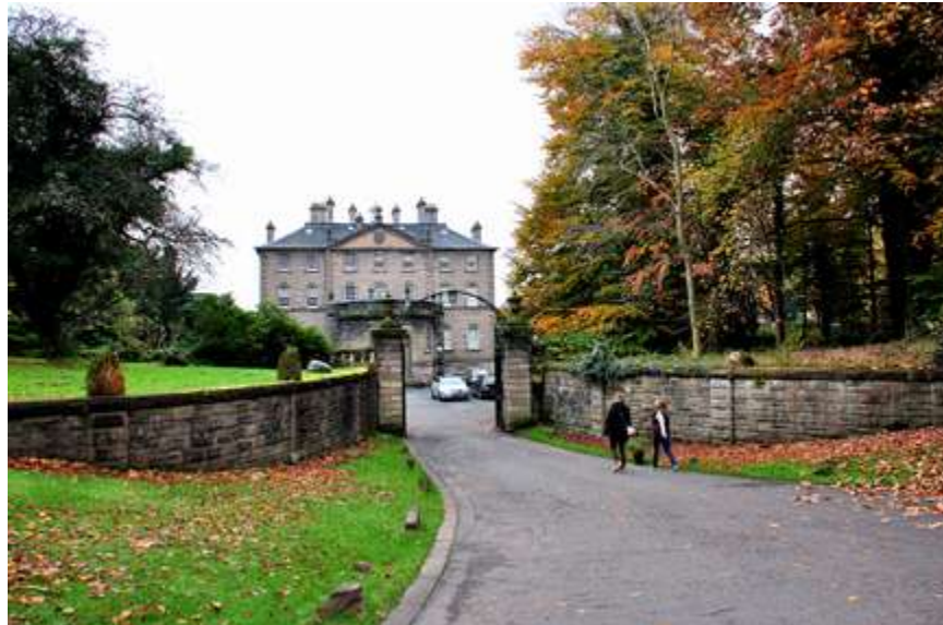
November at The Pollok House at the Pollok County Park, Glasgow.

https://en.wikipedia.org/wiki/Pollok_House#/media/File:The Pollok House at the Pollok County Park, Glasgow..JPG