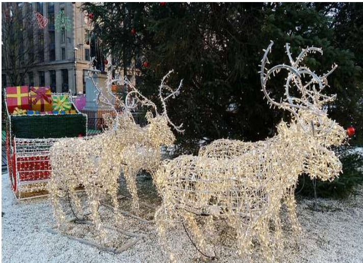
George Square, Glasgow. 2014 http://www.bit.ly/1LOWM7S