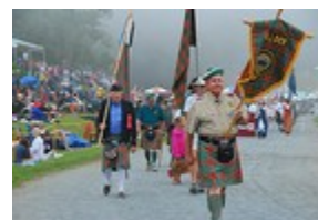
GMHG Parade of Tartans 2011 http://www.gmhg.org/paradeoftartans2011_page4.htm

Aug 4-5. St Andrew's Society of Detroit Highland Games. http://www.highlandgames.com